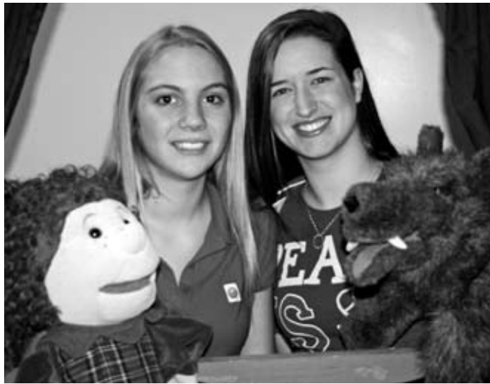
Peace Camp counselors teach the steps to peaceful conflict resolution using story of Red Riding and the Wolf.

For our first Peace Camp, we implemented many of Ms. Park’s program ideas. Since then, however, we have tailored, created, and tapped into many other sources to mold Camp activities based on our experiences and the response of the kids who have attended. Learning what works well and what didn’t through experience, our current four-evening Camp schedule runs for two and a half hours with a mixture of large group and small group activities. An example of our