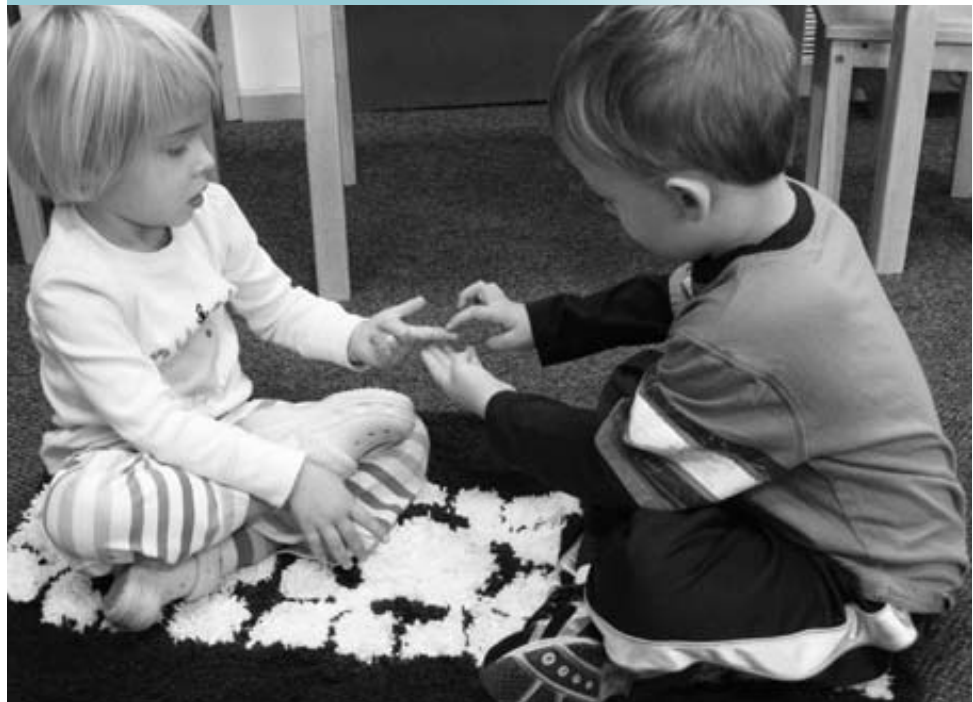
Two Montessori students sit on a Peace Mat. The boy had previously injured the girl. She expresses her feelings about the incident and he rubs her finger to make it feel better.