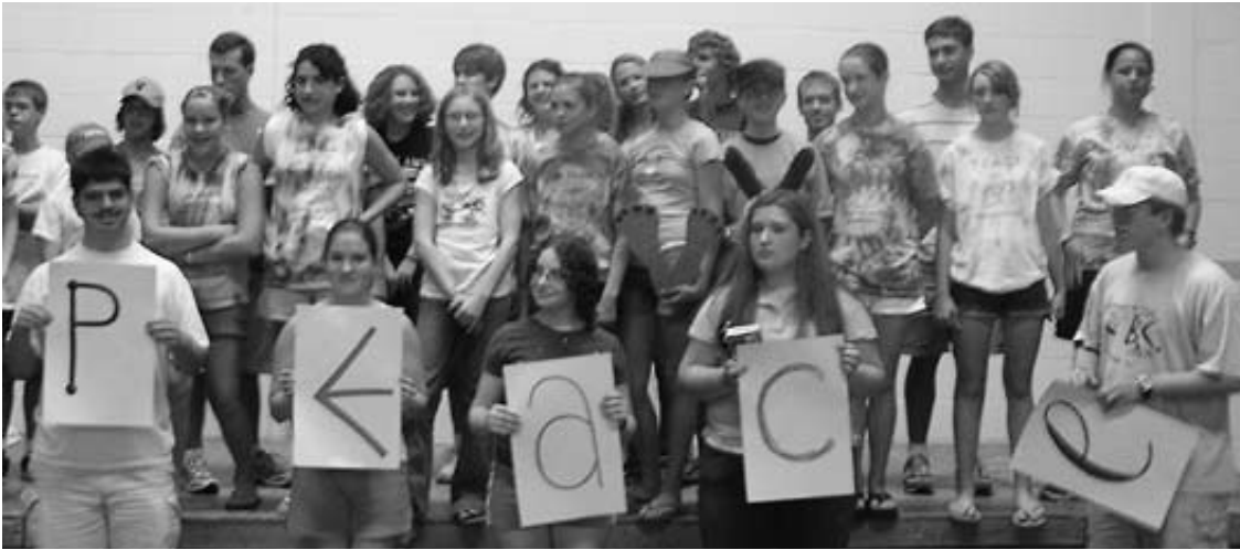
Peace Camp counselors share the message of peace with peace campers.

unfunded, completely volunteer activity that is intended to be recreational and educational but not clinically therapeutic. We have had a few circumstances when a child with more significant emotional needs may have been signed up for the Camp with some subsequent behavioral issues. So far, however, we have been able to both devote more of our own attention to those campers while also matching those children to more individual supervision with older, more experienced counselors, and no child to date has needed to leave Camp because of behavior.