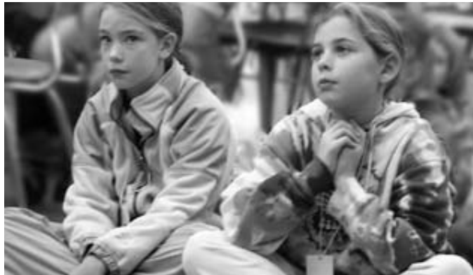
Peace Campers listen with rapt attention to the message.

I promise to try to not hurt others by my words or actions; to respect others, even if they are different from me (boys & girls, all colors and races, all countries, all religions.) I know that everyone deserves to be treated that way. I will try my hardest to keep my promise of peace. – Peace Camp Pledge